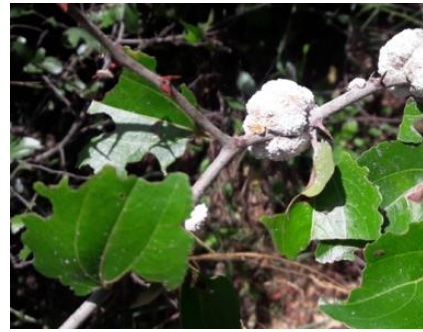
Smut galls on fruits and branches of Z. mucronata

Isolates collected from the site were identified on culture morphology and DNA sequences. First, isolations from dieback branches were made and pure cultures obtained. The isolates were then identified as belonging to the fungal family Botryosphaeriaceae based on the growth morphology on media (Figure). Isolates that belonged to this family were subsequently identified based on their internal transcribed spacer (ITS) sequences. For this purpose the ITS region was amplified and sequenced, the sequences were then compared for similarity against sequences available in a public DNA sequence database.