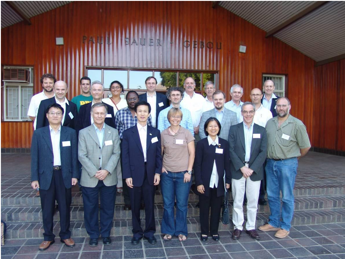
University of Stellenbosch's Department of Forestry

The first part of the IUFRO Management Committee's visit included two days of formal meetings at FABI. As a side event, FABI students and staff enjoyed a seminar dedicated to better understanding IUFRO and its many projects and programmes throughout the world. After completing their business at FABI, the IUFRO Management Committee proceeded to Cape Town where they met with the staff of the University of Stellenbosch's Department of Forestry, a lively event that was dedicated to sharing ideas and knowledge. This was followed by two days of visits to various sites on the Cape Peninsula where the group had the opportunity to learn of activities in the area related to forestry and forestry research.