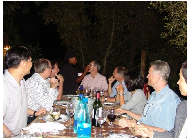
Dinner at Moyo's Restaurant near Stellenbosch