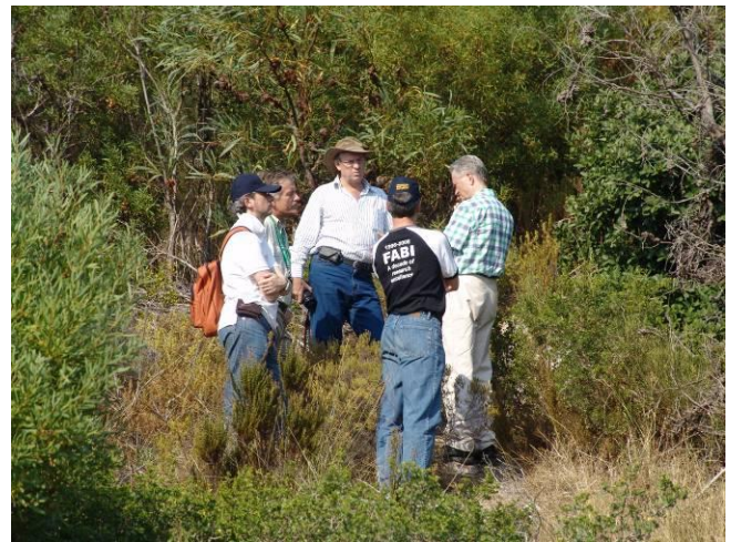
Looking at the biological control of Port Jackson in the Cape