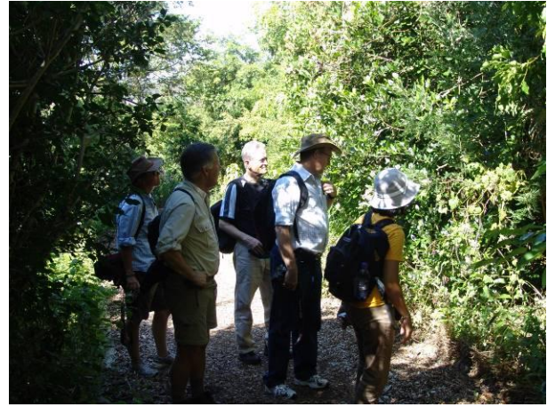
Visit to Kirstenbosch Botanical Gardens