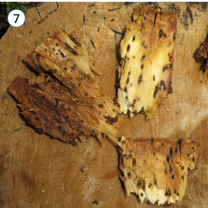
7. Photograph any pieces of wood with parts of galleries exposed to show the fungal stain.