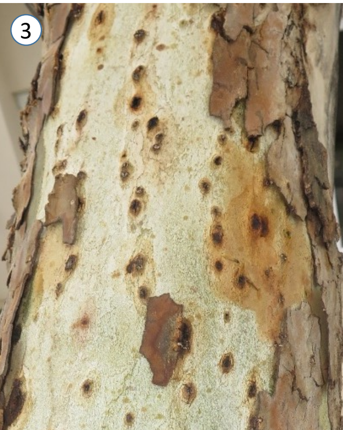
3. Zoom in on affected area.