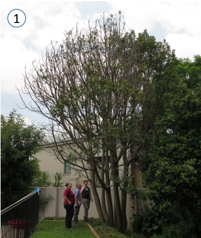
1. Picture of tree showing dying parts.