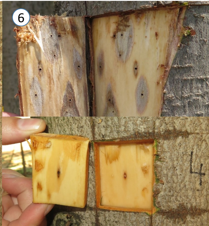
6. Carefully peel the bark to expose the tunnels penetrating the sapwood and the fungal stain surrounding it.