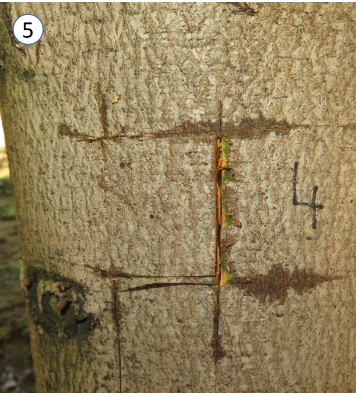
5. Use a knife or chisel to cut a square of bark around the entrance hole.