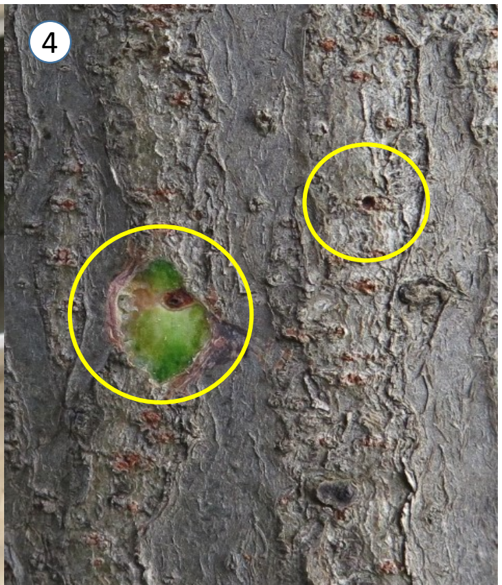
4. Zoom in on holes, scrape bark off one hole to show tunnel.