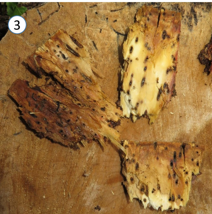
3. Cut or chisel out pieces of infested wood.