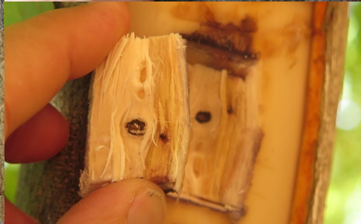
2. Cut or chisel out pieces of stained wood under the bark around tunnels of the beetles.