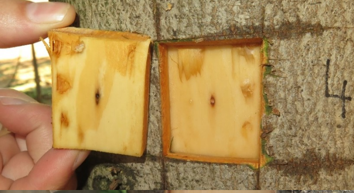
1. Cut & peel pieces of bark around entrance holes of the beetles.