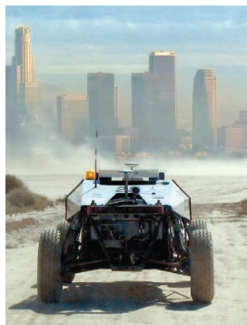
Grand Challenge course.

One example from the late 1960s was Multics, a joint effort of MIT and Bell Labs to create a new generation of operating systems (1). This was originally planned as a coordinated effort for dozens of researchers collaborating on what was then a big computer. It was preempted by an offshoot called Unix, a project on which nearly all of Multics' goals were achieved much more quickly by a single pair of researchers on a much smaller minicomputer. Unix soon became widely recognized as a big success; its present-day descendants include Linux. Multics eventually stumbled under its own weight and died.