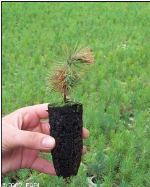
Pine seedling infected with F. circinatum