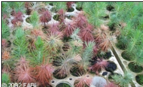
Dead and dying seedlings infected with F. circinatum

On seedlings, F. circinatum causes a serious root and root collar disease which results in the shoot tips wilting. The plants also change colour having an almost bluish tinge. Other symptoms include tip die-back and chlorotic or