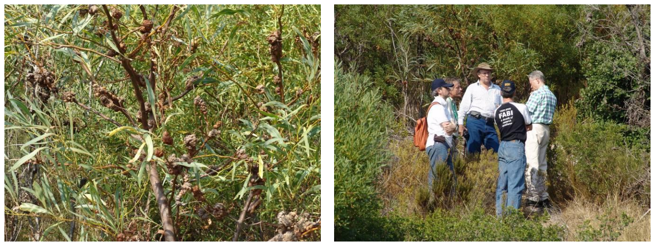
Looking at the biological control of Port Jackson in the Cape