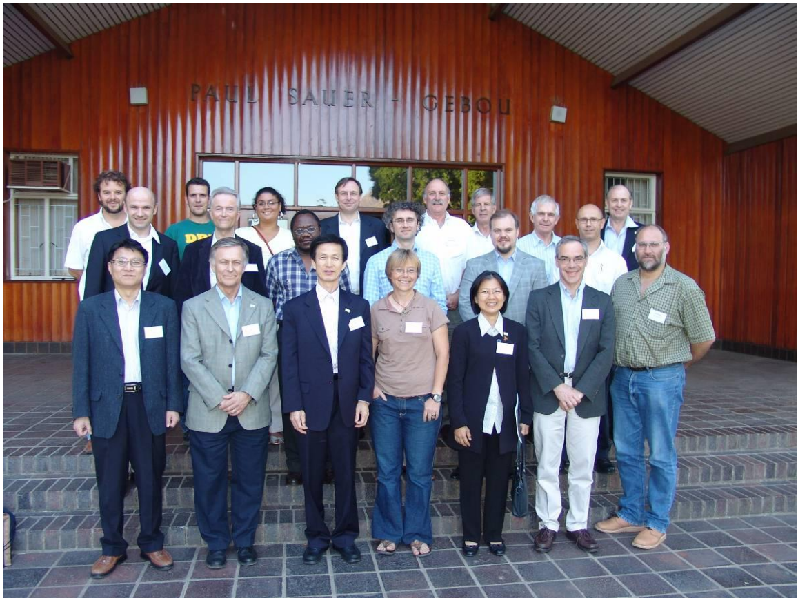
University of Stellenbosch's Department of Forestry

The first part of the IUFRO Management Committee's visit included two days of formal meetings at FABI. As a side event, FABI students and staff enjoyed a seminar dedicated to better understanding IUFRO and its many projects and programmes throughout the world. After completing their business at FABI, the IUFRO Management Committee proceeded to Cape Town where they met with the staff of the University of Stellenbosch's Department of Forestry, a lively event that was dedicated to sharing ideas and knowledge. This was followed by two days of visits to various sites on the Cape Peninsula where the group had the opportunity to learn of activities in the area related to forestry and forestry research.