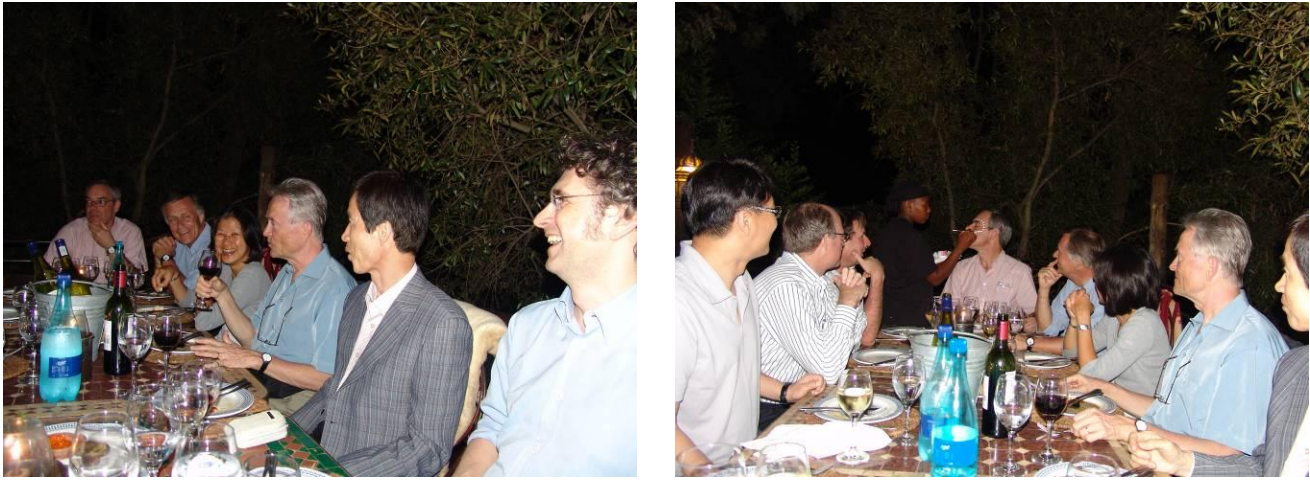
Dinner at Moyo's Restaurant near Stellenbosch