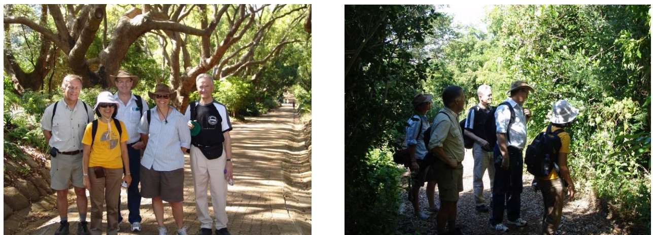
Visit to Kirstenbosch Botanical Gardens