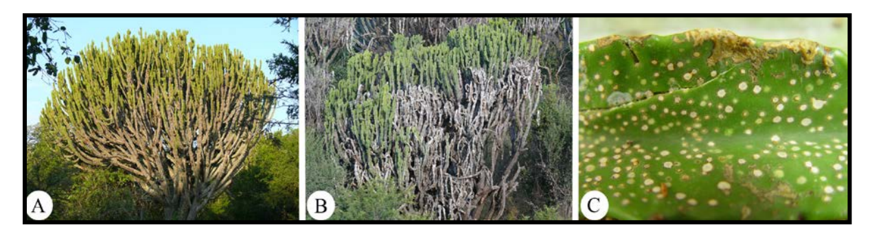
Figure 1: Disease symptoms on Euphorbia ingens trees. (A) Euphorbia ingens tree with gray discoloration. (B) Dying E. ingens tree with rotten branches. (C) Various spots and lesions on a succulent branch from an E. ingens tree.

In the last 15 years, there have been alarming reports of large-scale decline and death of Euphorbia ingens trees in South Africa. Mortality of these trees has been particularly severe in the Limpopo Province. Symptoms associated with the death of trees include greying and spots on the succulent branches (Figure 1) and infestation by branch and stem boring insects. Earlier investigations into the cause of the disease yielded various fungal and insect groups, including several unknown species. In 2009 researchers from the DST/NRF Centre of Excellence in Tree Health Biotechnology at the University of Pretoria undertook a more detailed study of the possible causes of mortality of these iconic trees as part of an MSc project.